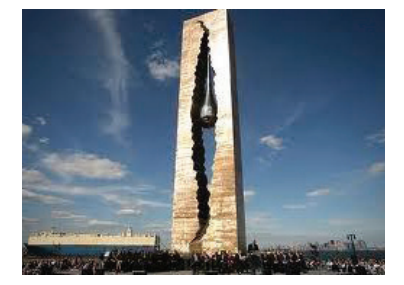
Zereteli | "To the Struggle Against World Terrorism", Bayonne, New Jersey (USA) | 2006