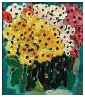
Zereteli | A Spray of Bright Flowers | 2005