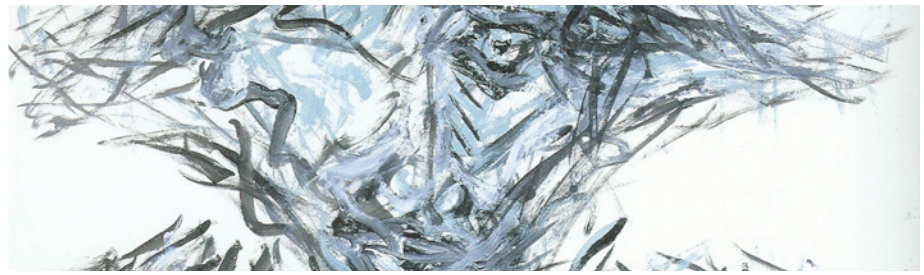
Angel Orensanz | The Hunter, Rendsburg | 2000 | Yan Leus was inspired by these series of drawings.

During the II Russian Arts Festival, the original recording of Yan Leus concert will be played two nights: on opening night, November 14, and on December 14.