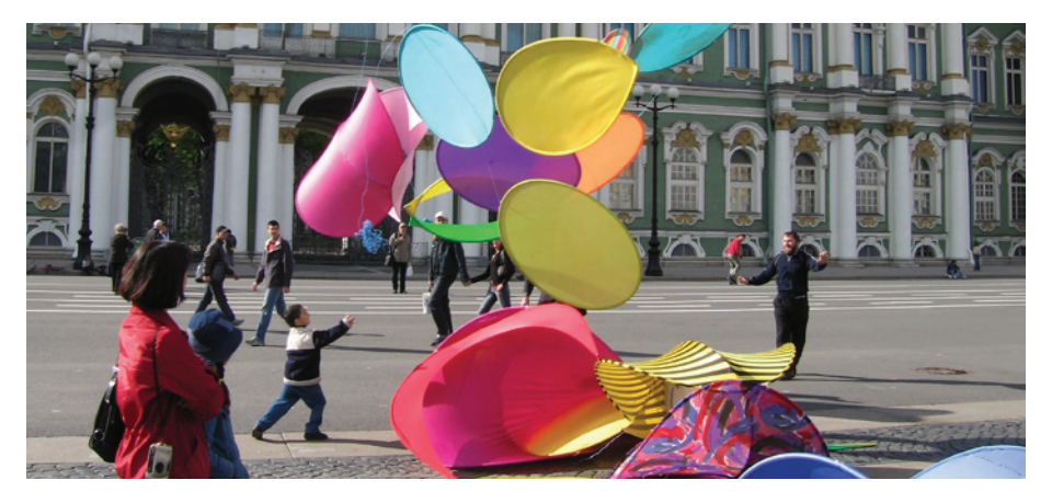
Angel Orensanz | Wind Tides 2, Hermitage Museum Square, St. Petersburg | 2005